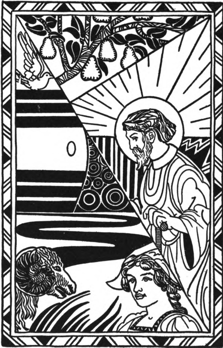
The Angel Took the Form of a Beggar